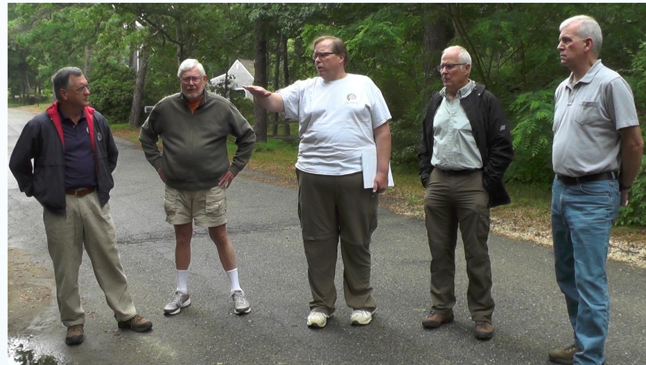
Discussing a potential stormwater project at Blueberry Pond.