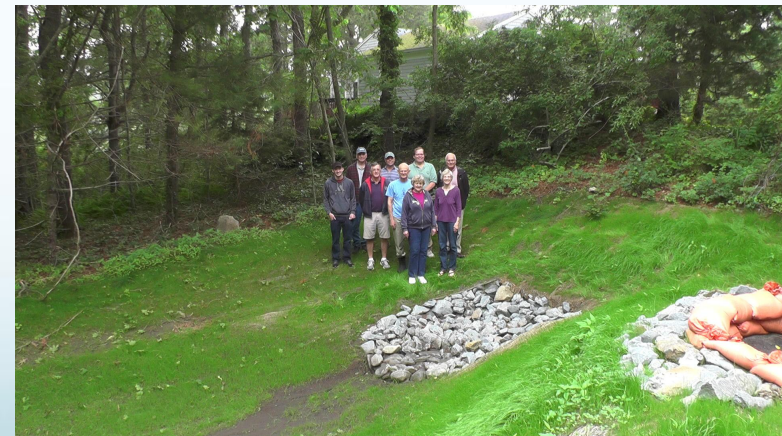
Blueberry Pond stormwater project