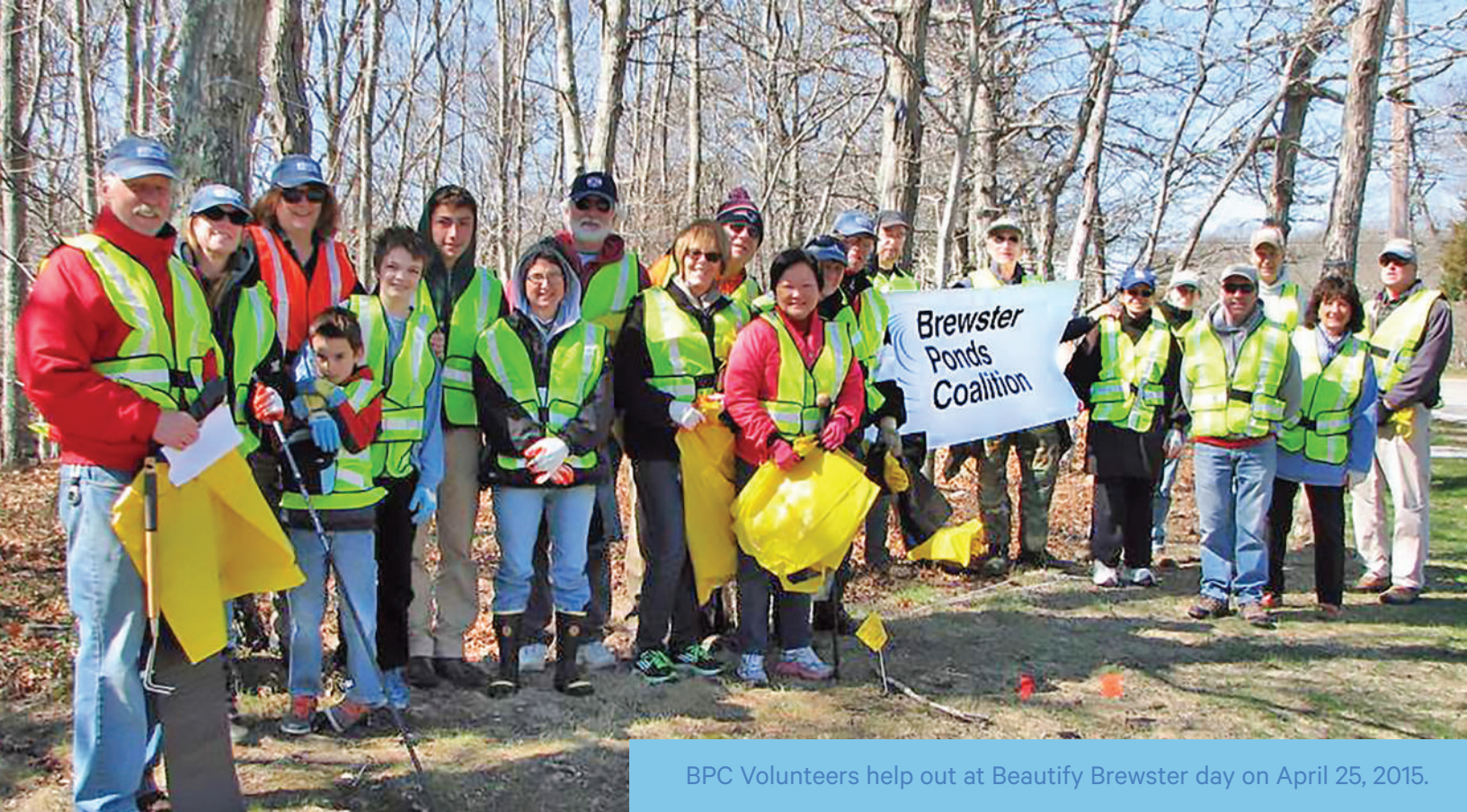
BPC Volunteers help out at Beautify Brewster day on April 25, 2015.