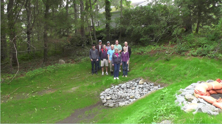
Blueberry Pond stormwater project